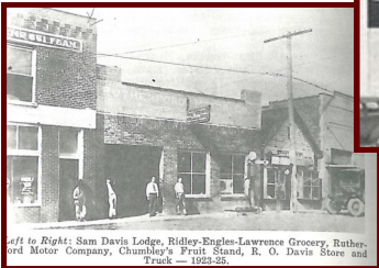
Left to Right: Sam Davis Lodge, Ridley-Engles-Lawrence Grocery, Rutherford Motor Company, Chumbley's Fruit Stand, R. O. Davis Store and Truck - 1923.25.